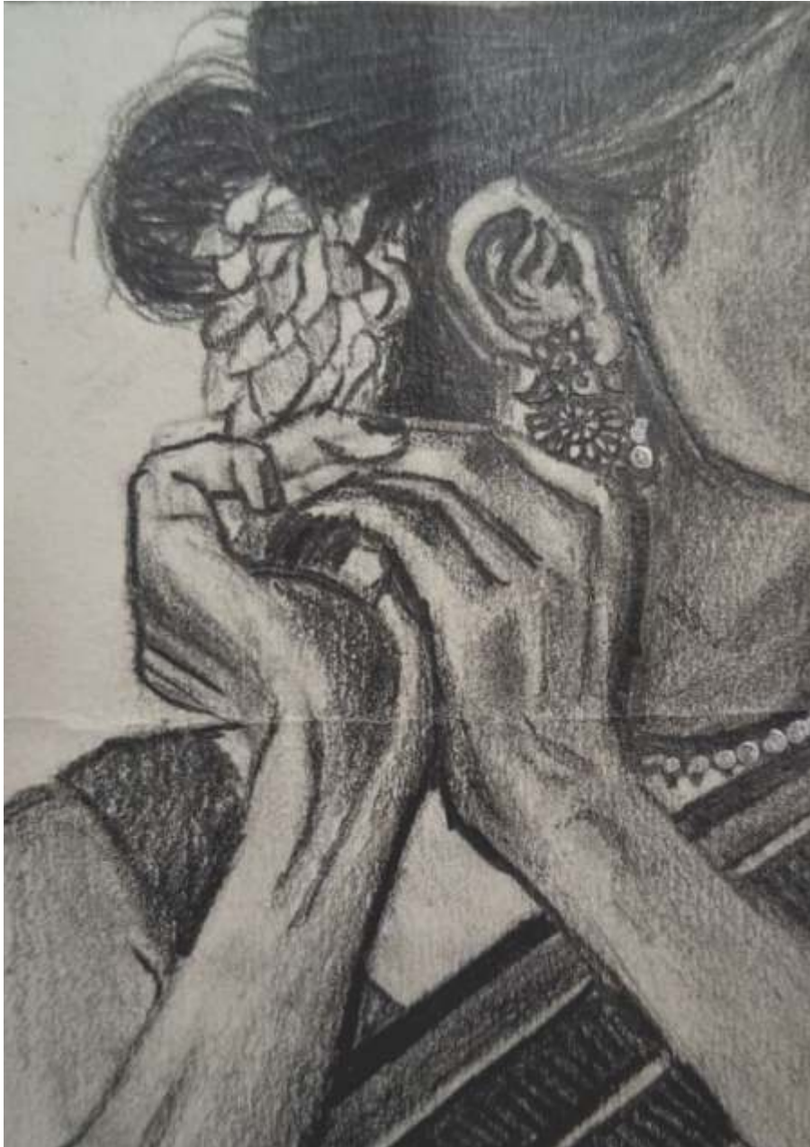
Sachi Prashant Bisanal 8-Vega